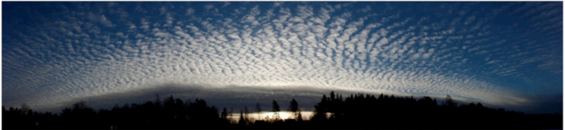
unbelievable cloudes on a morning over Simsjön